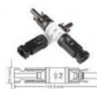
Diode Connector PV004-D