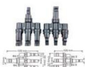
3 to 1 T Branch Connector