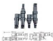
2 to 1 T Branch Connector