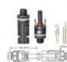
Plate End Connector PV004-P