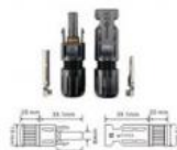
Solar PV Connector PV004