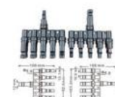
5 to 1 T Branch Connector