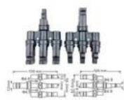
3 to 1 T Branch Connector