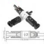
Diode Connector PV004-D