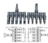
5 to 1 T Branch Connector