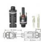
Plate End Connector PV004-P