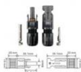
Solar PV Connector PV004