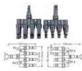
4 to 1 T Branch Connector