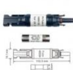
Fuse Connector PV004-F