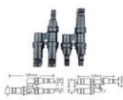
2 to 1 T Branch Connector