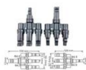
3 to 1 T Branch Connector