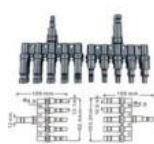
5 to 1 T Branch Connector