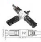
Diode Connector PV004-D