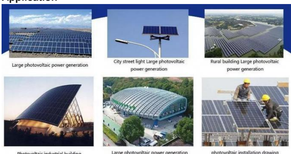
Photovoltaic industrial building