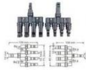
4 to 1 T Branch Connector