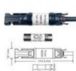
Fuse Connector PV004-F