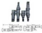
2 to 1 T Branch Connector