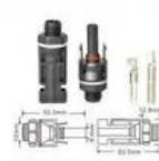
Plate End Connector PV004-P