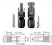
Solar PV Connector PV004