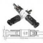
Diode Connector PV004-D