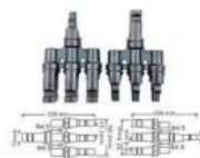
3 to 1 T Branch Connector