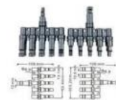
5 to 1 T Branch Connector