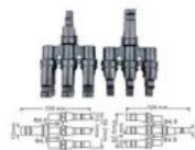
3 to 1 T Branch Connector