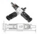
Diode Connector PV004-D