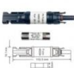
Fuse Connector PV004-F