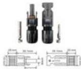
Solar PV Connector PV004