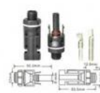
Plate End Connector PV004-P