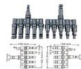
5 to 1 T Branch Connector