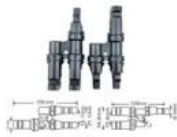
2 to 1 T Branch Connector