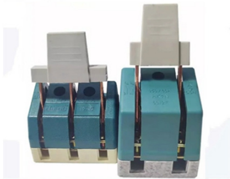
Changeover Knife / Isolator Switch