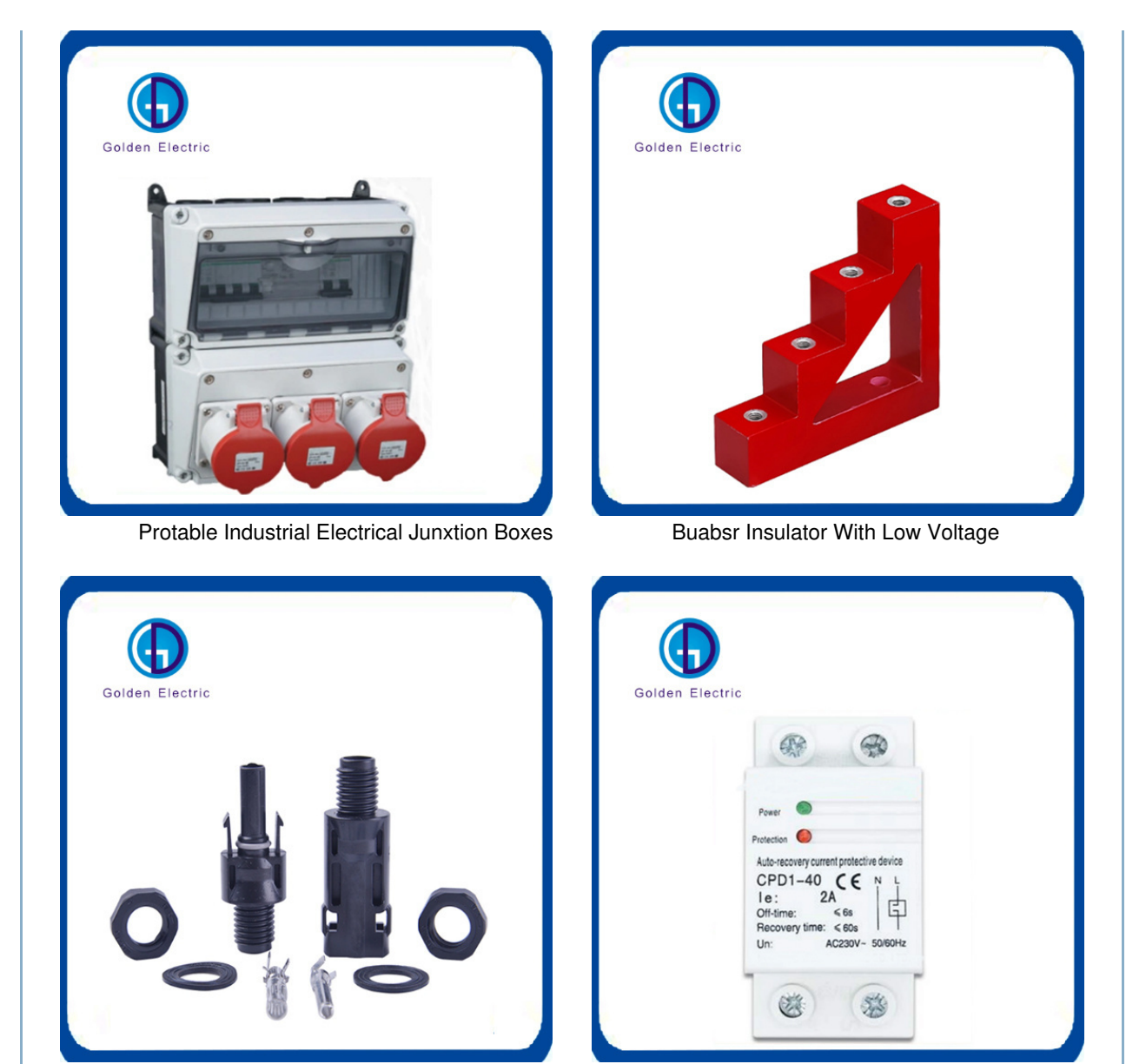
Mc4 1Input 1 Output PV Cable Connector

Automatic Recovery Over and Voltage Protector