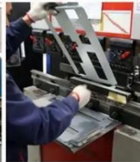
3. CNC Bending