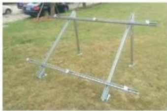
Solar system bracket