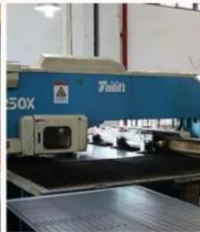
2. CNC Punching