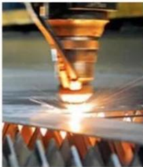
1. Laser cutting

OEM Service, Please Send Your Drawings in CAD or PDF