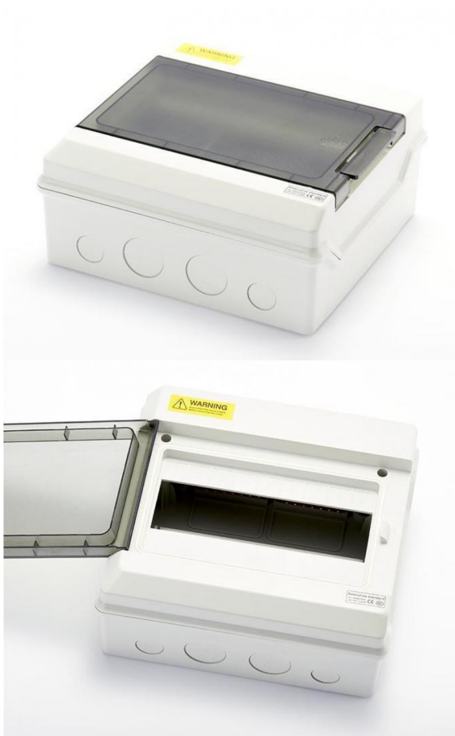
Other series of distribution boxes