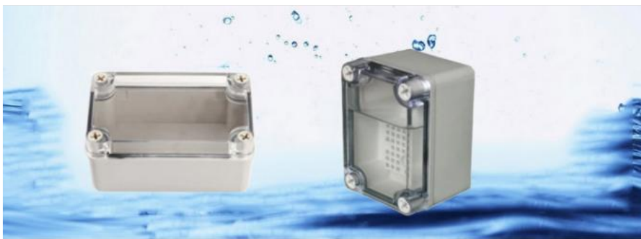
IP66 plastic junction box with clear lid