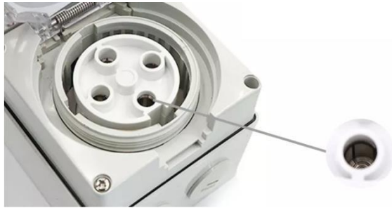
Nickel Plating on Copper Material H59-1

Made of Rubber, it has good corrosion resistance, Strong tightness. It can achieve better waterproof effect.