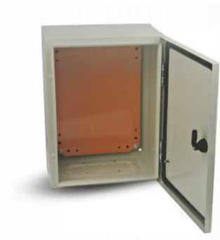
ME Series MED Series