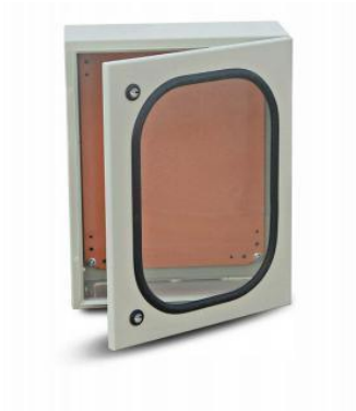
MEP Series MEI Series