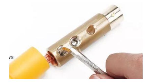
Thread the wire into the housing Link the copper wire and tighten the screws

Align the card slots with the copper rod Place in the card sleeve