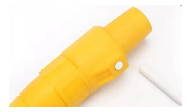
Place the screws into the hole Fixed well