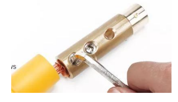
Thread the wire into the housing Link the copper wire and tighten the screws

Align the card slots with the copper rod Place in the card sleeve