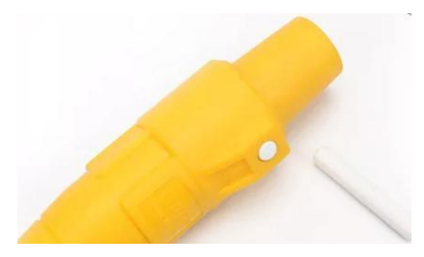
Place the screws into the hole Fixed well