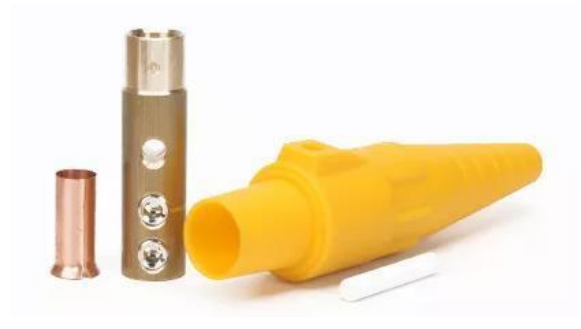
Unplug the rhino socket

Use a hex wrench Loosen the two screws Place the scalloped copper sheet put it inward