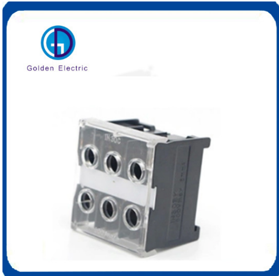
High Quality in Series 50A Terminal Block