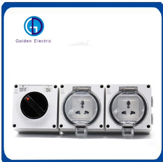
Multi-Function Waterproof Switch and Socket for Wall