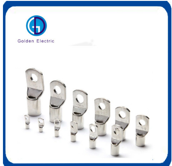
Tinned Plated Copper Cable Lug