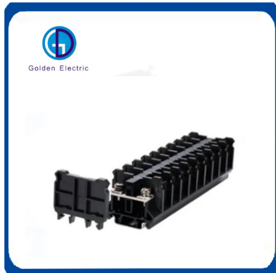
DIN Rail Type Screw Crimping Terminal