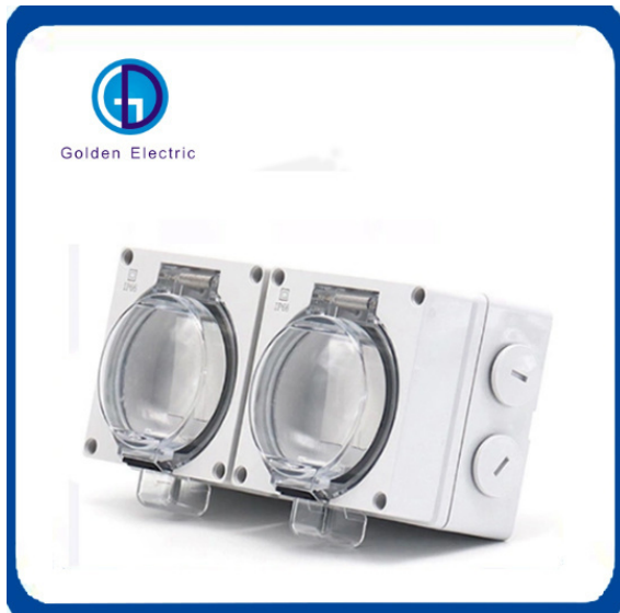
Waterproof 2 Gang Socket Switch with Waterproof Cover