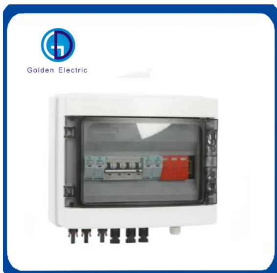
Gd 4/1 Waterproof Combiner Box with SPD and Fuse