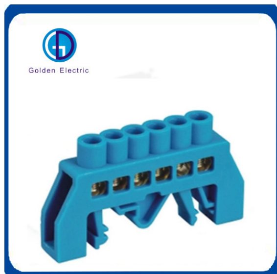
Customized Plastic Copper Screw Terminal Block