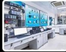
INDUSTRIAL CONTROL INSTRUMENTS