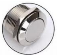
Nickel Plate Brass