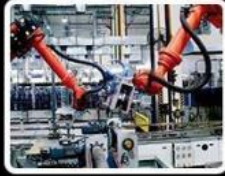
HOME APPLIANCE MANUFACTURING