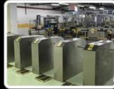
ACCESS CONTROL EQUIPMENT