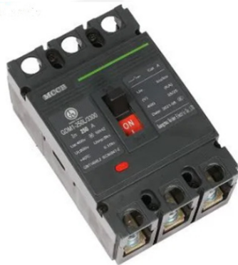
DC Moulded Case Circuit Breaker for Solar System