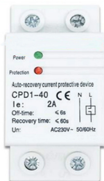
Automatic Recovery Over and Under Voltage Protector Device Box