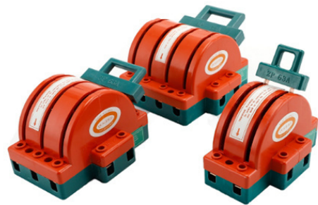
Knife Change Over Switch