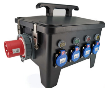
Waterproof Socket Insulator Socket Box