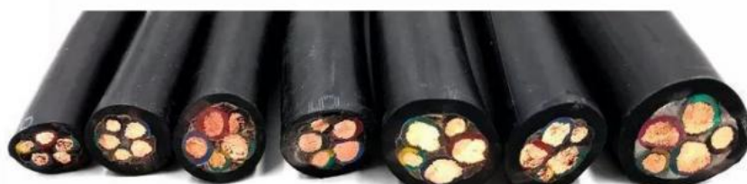
YC YC YC YC YC YC YC 3X4+2X2.5 3X6+2X4 3X10+2X6 3X16+2X10 3X25+2X16 3X35+2X16 3X50+2X16