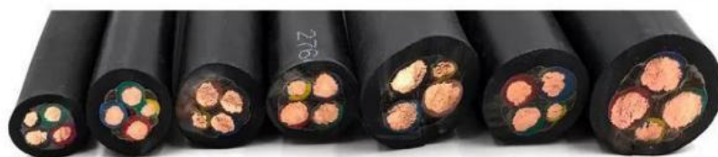
YC YC YC YC YC YC YC 3X4+1X2.5 3X6+1X4 3X10+1X6 3X16+1X10 3X25+1X16 3X35+1X16 3X50+1X25