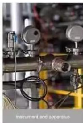
instrument and apparatus