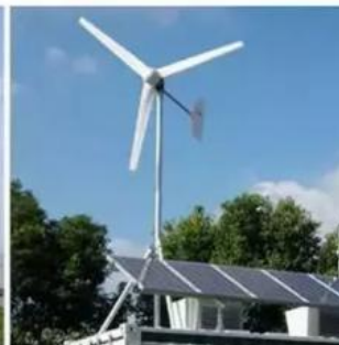
Forest fire protection