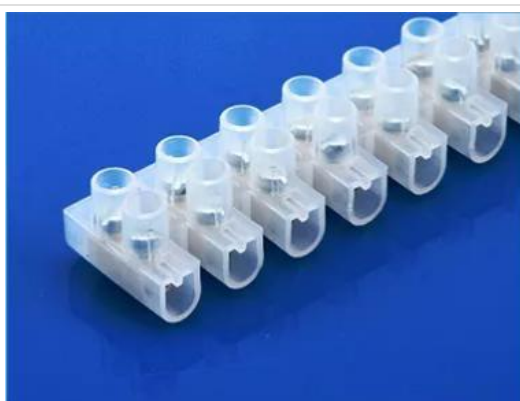
High Quality Raw Material