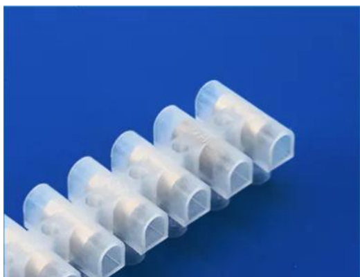
Scientific Structure Design