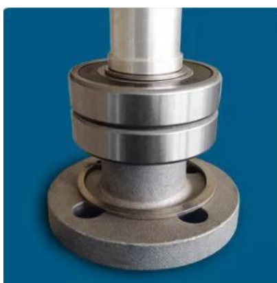
Double bearing low operating vibration and stronger wind resistance