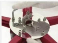
2. Tighten all 5 pairs of bolts with hex wrench;