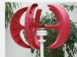
6. Connect battery cables to controller firstly, then connect the wind turbine lead wire to controller terminal.