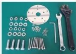
1. Prepare all accessories as picture shows;