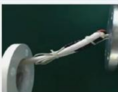
4. Connect three output wires of wind generator With transmission line, lines splicing length should longer than 30mm, insulating tape fasten at 100mm of coupling end;