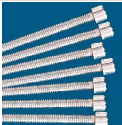
316 Stainless Steel anti-loose Bolts, Corrosion Resistance, Longer Service Life

The blades are made of Nylon fiber, optimized aerodynamic shapedesign, start wind speed delivery