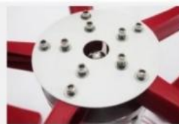
3. When finished, like the picture shows above;