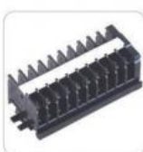
TK-020 导线截面wire section: 1-2.5mm 2 额定电流/电压 rated current/ voltage: 20A/660V 宽/高/厚wide/high/ thick: 40.5/34.5/10.2mm