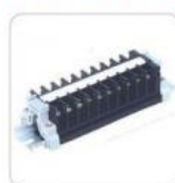
TK-010 导线截面wire section: 0.75-1.5mm 2 额定电流/电压 rated current/ voltage: 15A/600V 宽/高/厚wide/high/ thick: 40.5/48/8.7mm