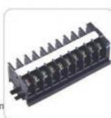
TK-030 导线截面wire section: 1.5-6mm 2 额定电流/电压 rated current/ voltage: 30A/660V 宽/高/厚wide/high/ thick: 40.5/36.5/12mm