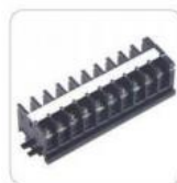
TK-040 导线截面wire section: 4-8mm 2 额定电流/电压 rated current/ voltage: 40A/660V 宽/高/厚wide/high/ thick: 40.5/36.5/14mm