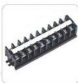
TK-060 导线截面wire section: 4-10mm 2 额定电流/电压 rated current/ voltage: 60A/660V 宽/高/厚wide/high/ thick: 48/42.5/16mm