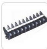
TK-0100 导线截面wire section: 10-25mm 2 额定电流/电压 rated current/ voltage: 100A/660V 宽/高/厚wide/high/ thick: 53/42.5/20mm