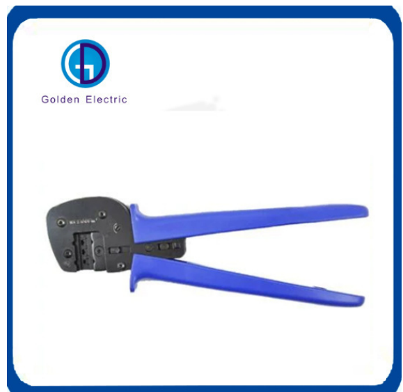
PV Solar Cable Coonector Waterproof Pliers