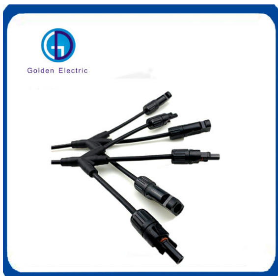
PV Connector Match With Mc4