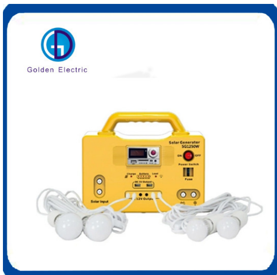
Solar Energy System Lighting Small System