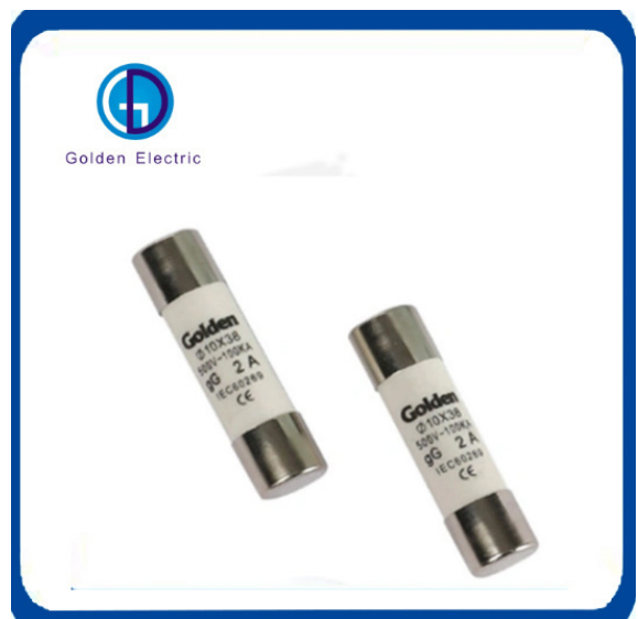
Solar PV DC Ceramic Fuse Holder and Fuse