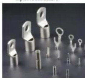
Copper Bare Terminal