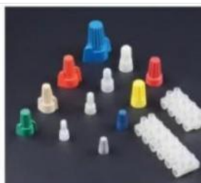
Closed end Terminal