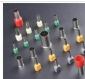
Tube Type Terminal