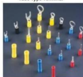
Insulated Copper Terminals