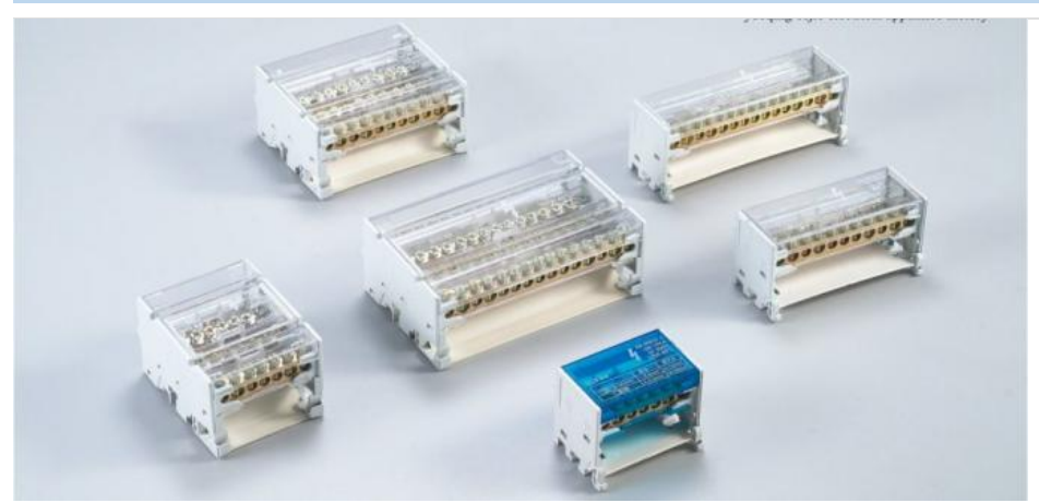
Connector Box Series