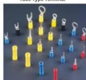
Insulated Copper Terminals