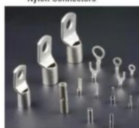
Copper Bare Terminal