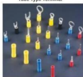
Insulated Copper Terminals