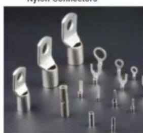
Copper Bare Terminal