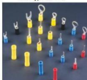
Insulated Copper Terminals