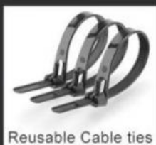
Reusable Cable ties