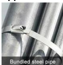
Bundled steel pipe