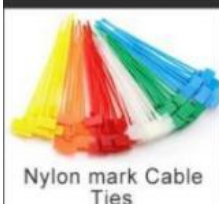
Nylon mark Cable Ties