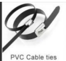
PVC Cable ties