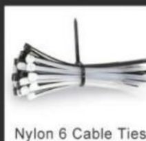
Nylon 6 Cable Ties