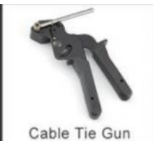
Cable Tie Gun