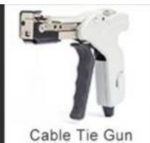
Cable Tie Gun