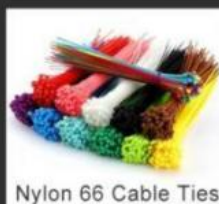
Nylon 66 Cable Ties