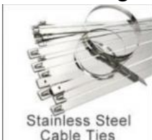
Stainless Steel Cable Ties