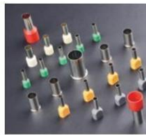
Tube Type Terminal