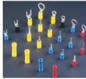
Insulated Copper Terminals