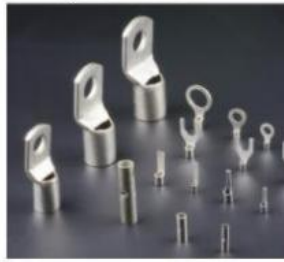
Copper Bare Terminal