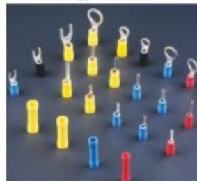
Insulated Copper Terminals