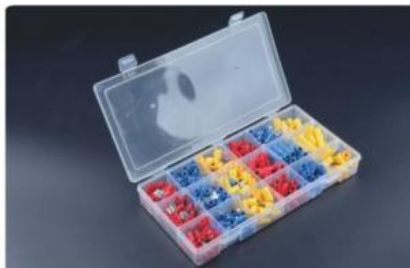
Value Pack: No. 177 (50 pieces box) 175 PCS 10 TYPES Assortment