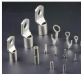
Copper Bare Terminal