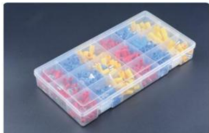
Value Pack: No. 177 (50 pieces box) 175 PCS 10 TYPES Assortment