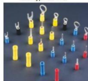
Insulated Copper Terminals