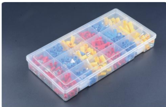
Value Pack: N-175(plastic box) 175 PCS 16 TYPE Assortment