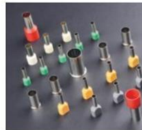
Tube Type Terminal