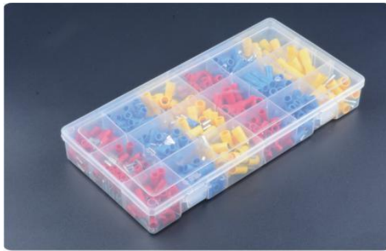
Value Pack: N-175(plastic box) 175 PCS 16 TYPE Assortment