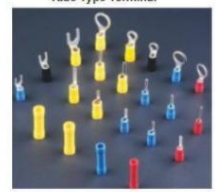
Insulated Copper Terminals