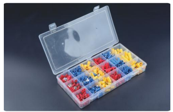
/alue Pack: N=175(plastic box) 175 PGS 18 TYPE Assortment