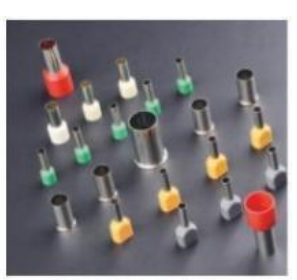
Tube Type Terminal