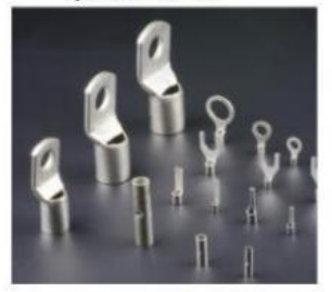
Copper Bare Terminal