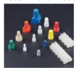
Closed end Terminal