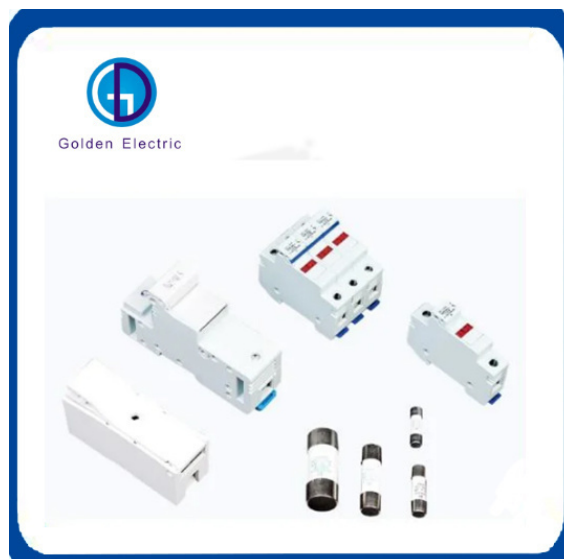
Tag Low Voltage Fuse Link