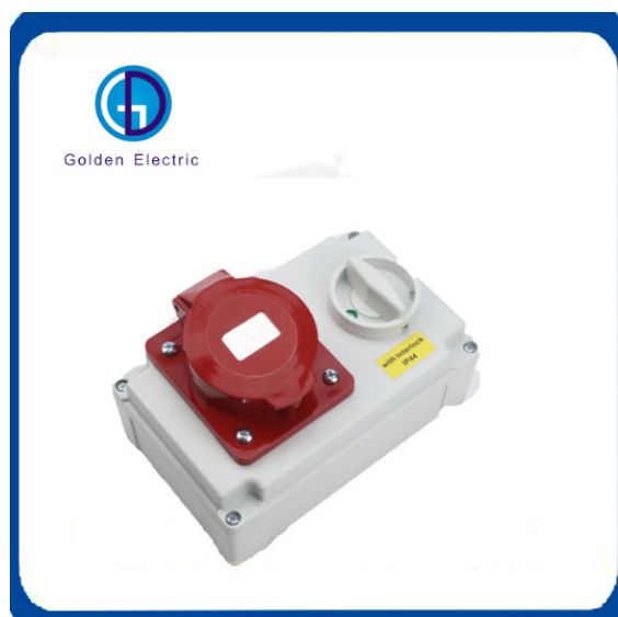
Receptacle and Switch With Interlock