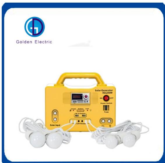
Solar Lighting Small Systm