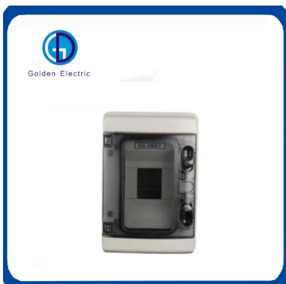
Plastic Electrical Distribution Box Waterproof Box Device