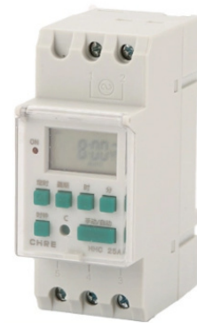
Time Delay Switch Controller