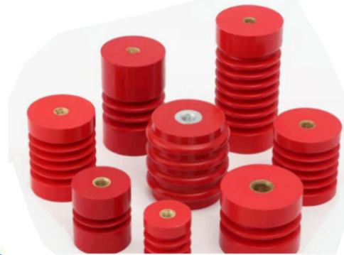
Bus Bar Support Bus Bar Insulator