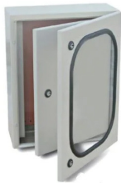
Plexiglass Door Waterproof Power Distribution Box