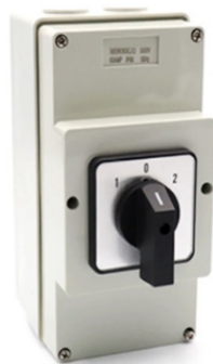
Industrial Weather Protected Changeover Switch