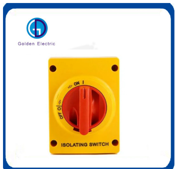
AC Isolator Switch