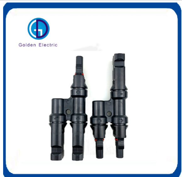
MC4 Solar Connector 2 in 1 Branch Multiple PV Connector