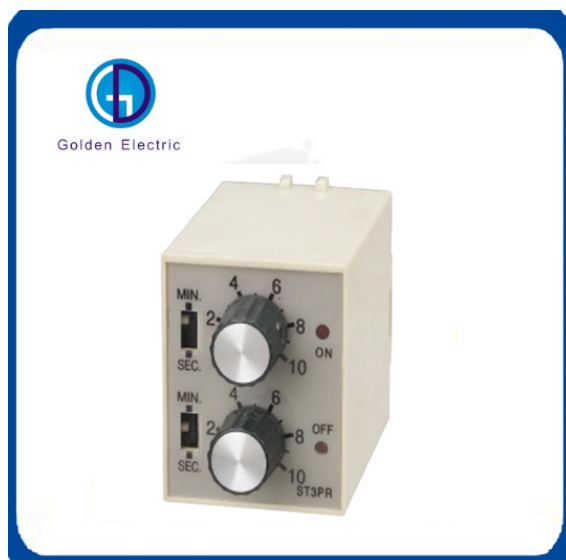
AC 220V Time Relay