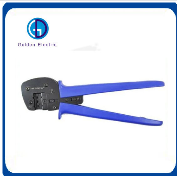
MC4 Crimping Tool