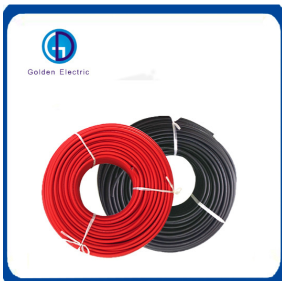
Solar PV Cable with MC4 Connector