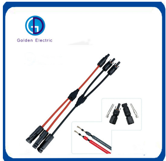
MC4 Cable Connector