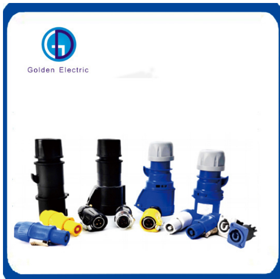
Waterproof Industrial Plug and Socket