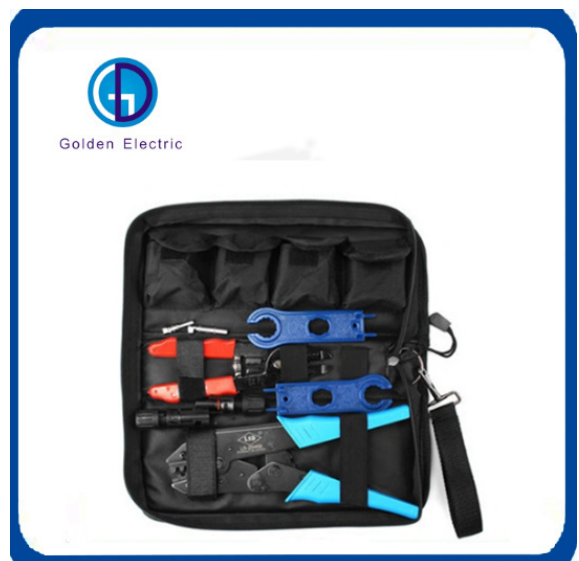
MC4 Solar Crimping Tool Kits