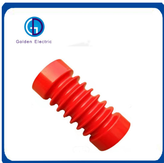
High Voltage Standoff Insulator