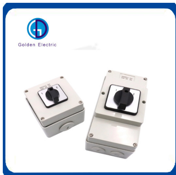
Industrial Weather Protected Changeover Switch