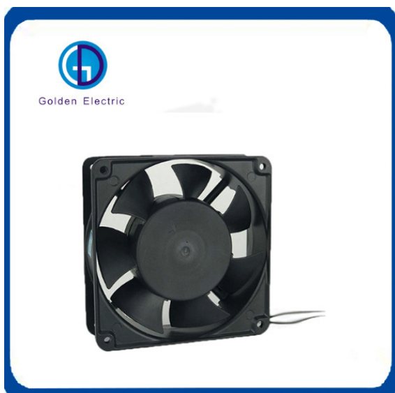
AC Axial Fan /Ventilation Fan for Control Panel