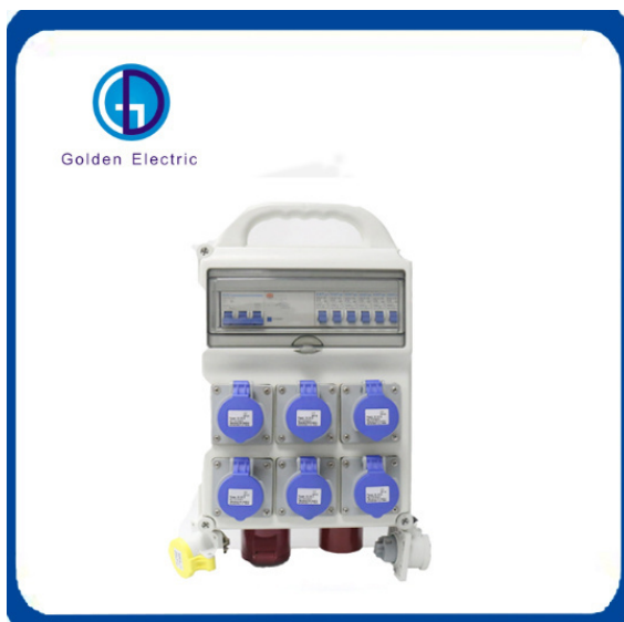
Industrial Plastic Combined Socket Distribution Box