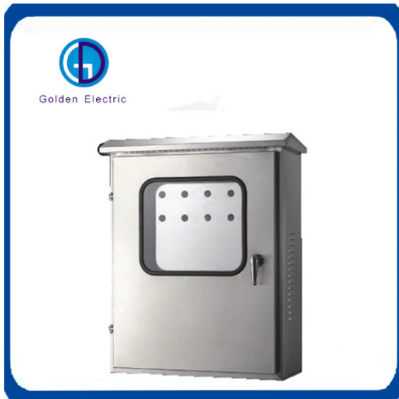
Stainless Steel Meter Enclosure Distribution Box