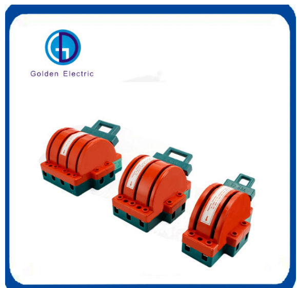
Double -Throw Knife Switch