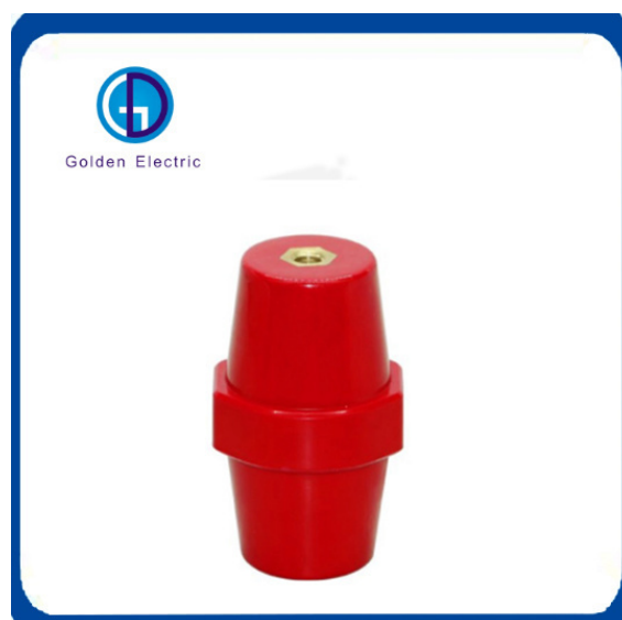
Bus Bar Insulation Standoff Composite