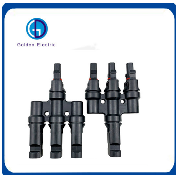
Mc4 3 in 1 out Connector