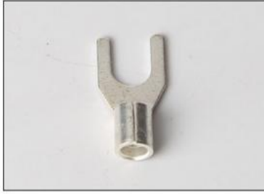
1. Put the product away