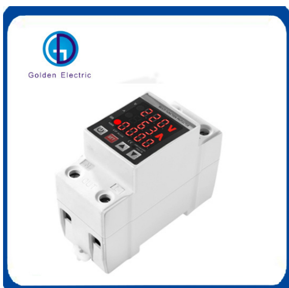
Over Under Adjustable Single Phase Voltage Insulator