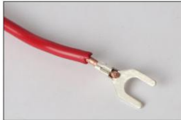
4. Let go and you're done