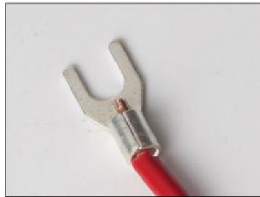
2. Insert the wire into the terminal hole