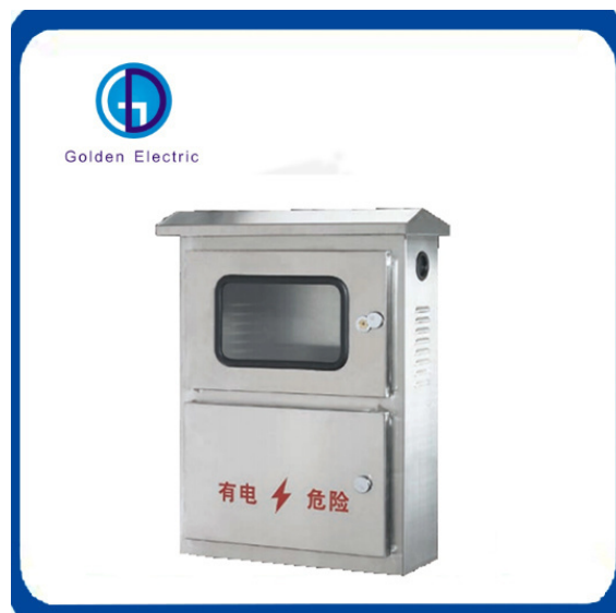
Stainless Steel Doudoor -Door Meter Box Distribution Box