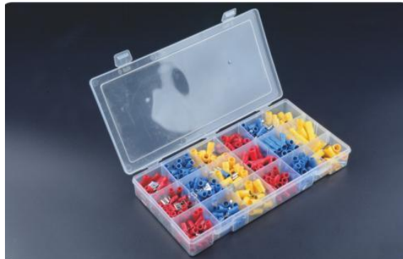
Value Pack: N-175(plastic box) 175 PCS 18 TYPE Assortment