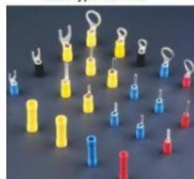
Insulated Copper Terminals