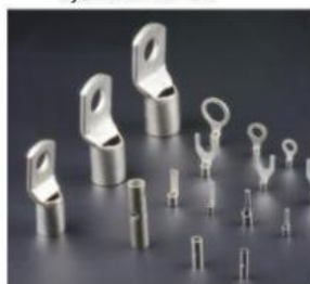
Copper Bare Terminal