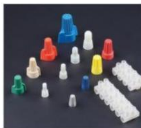
Closed end Terminal