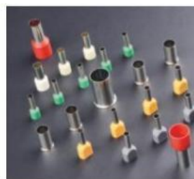
Tube Type Terminal