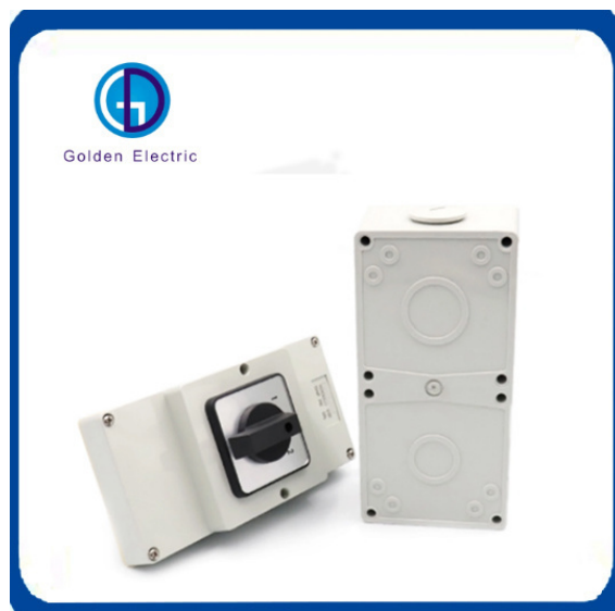
Industrial IP66 Weather Protected Changeover Switch