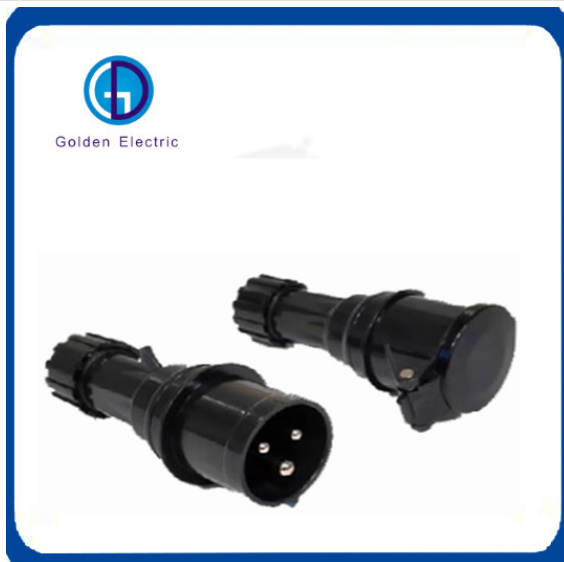
Waterproof Electrical Industrial Plug Connector