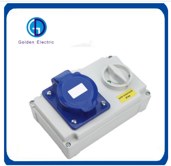
Receptacle and Switch Interlock Device