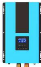
RP 3K(low cost)