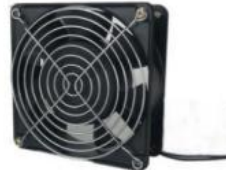
12038 Ventilation Fan for Control Panel 120mm 120X120X38 AC Axial Fan 220V 240V