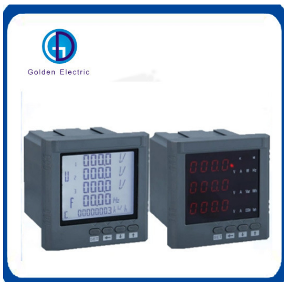
Multi-Function Voltage Meter