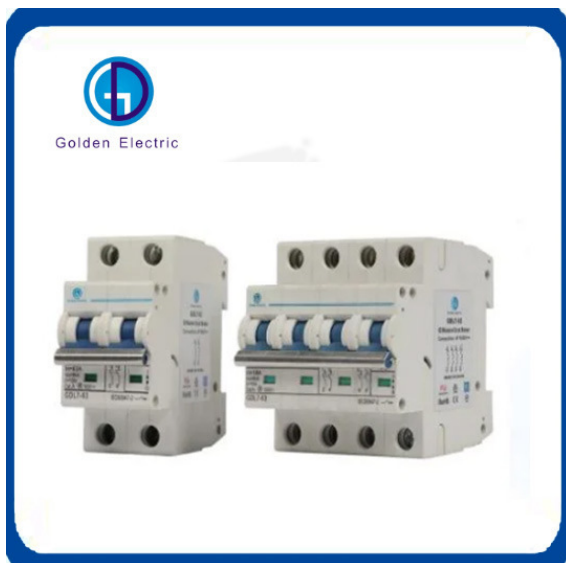
Solar PV DC Miniature Circuit Breaker Copper