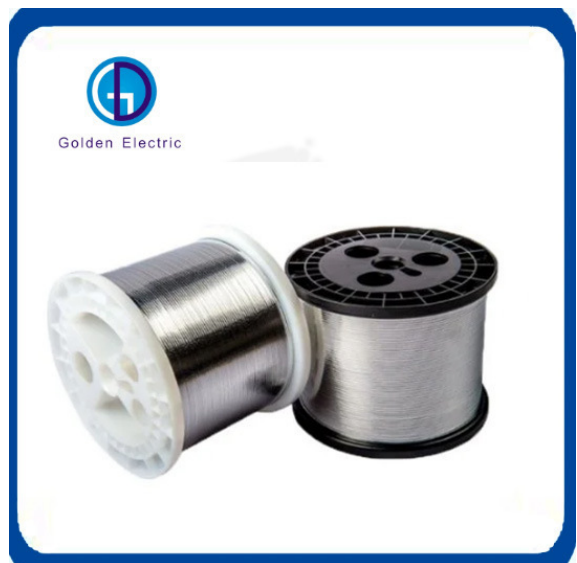
PV Solar Panel Tin/ Nickel /Silver Plated Alloy Ribbon