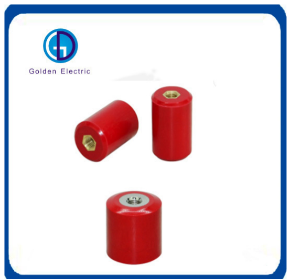
Low Voltage Buabar Insulator