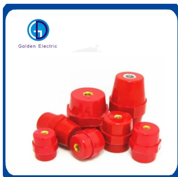
DMC Busbar Insulator Composite