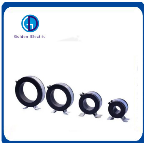
Waterproof Current Transformer