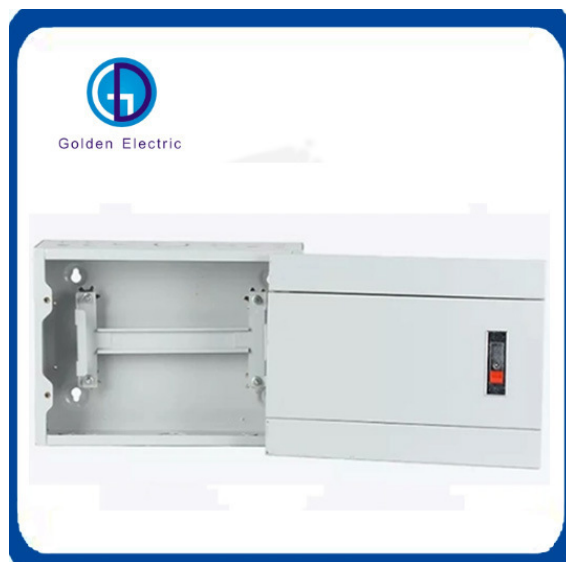
Power Steel Distribution Box Electrical