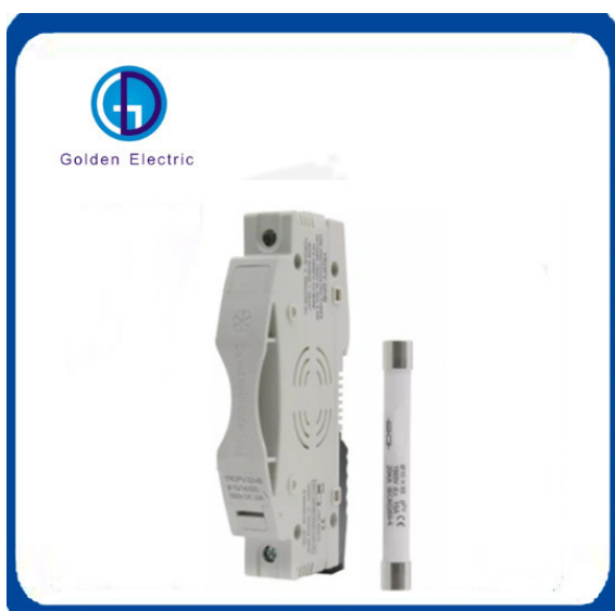
Solar PV DC Fuse Components Insulator